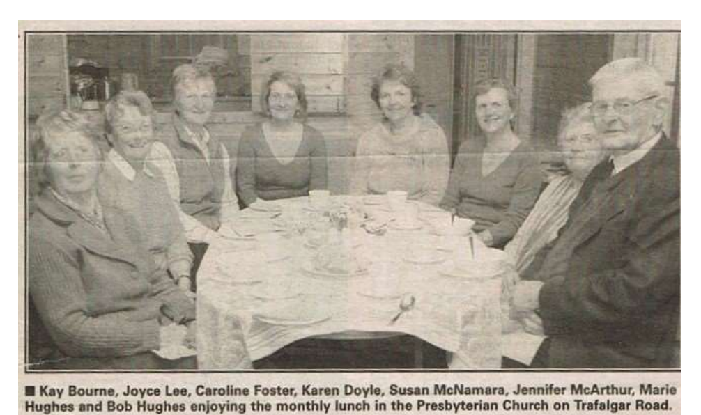
Group photo Bray People 14/2/2007

Over the years our team has changed from the original one and it is lovely to see people volunteering to help either on the Tuesday morning or by making soup, sandwiches or cakes. We need at least six people to provide food and help on Tuesday mornings. Not everyone is available each Tuesday so we are always open to accept offers! It's a busy day but we also have lots of fun and meet with lovely people. We sometimes have the added bonus of music beautifully played during mealtimes by our Minister Gary.